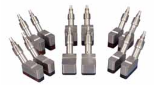
GE technologically advanced clamp-on gas ultrasonic transducers

The new line of clamp-on gas transducers produces signals that are five to ten times more powerful than those of traditional ultrasonic transducers. The new transducers produce clean, coded signals with very minimal background noise. The result is that the DigitalFlow GC868 flowmeter system performs well even with low-density gas applications.